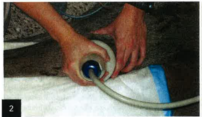
ESWT on a 5-year-old spayed Great Dane with arthritic stifle joint

Several studies have demonstrated positive results in joint range of motion and peak vertical force—as measured using force plate analysis—in dogs with stifle (Figure 2), hip, and elbow arthritis. For example, in dogs with unilateral elbow OA treated with ESWT, improvement in lameness and peak vertical force was equivalent to that expected with NSAIDs. 11